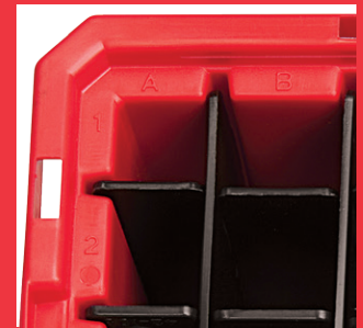
Grids are molded with a letter/number system for easy parts tracking.