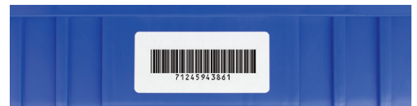
29203 Adhesive Label