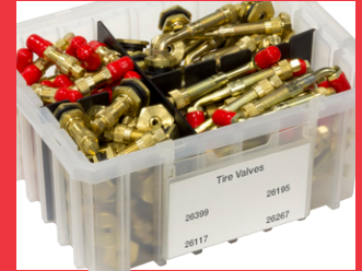
Label Holders snap in securely on any side.