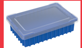
Snap-on lids keep items dust-free.