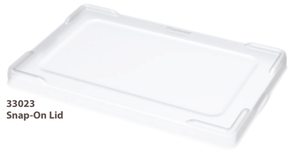
33023 Snap-On Lid