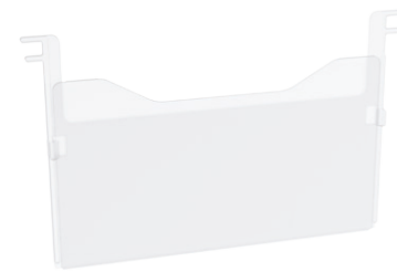
35011 Label Holder