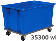
35300 with RU843HR1828